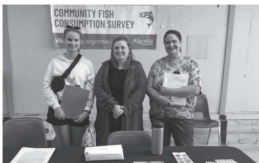
Photo: An important survey of fish stocks in the Spanish River is underway. Surveyors were on hand at the Massey Agricultural Fair this past weekend asking for participation by the public. The survey is available online.

A survey of the fish stock in the Spanish River has not been done in many years, so the Spanish Harbour Area of Concern in Recovery proponents is conducting an updated survey.