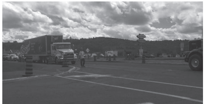
Photo: Phase three of the resurfacing of Highway Six in the Town of Espanola includes the installation of lights. Espanola council approved the third phase of the connecting link project from MacDonalds to Second Avenue on Centre Street in late June at a cost of just over $6-million dollars accepting the bid from Garson Pipe Incorporated.

It has been discussed for years but is now coming to fruition, there will be traffic lights in Espanola's south end.